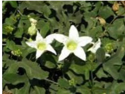
Figure 3. Coccinia indica L