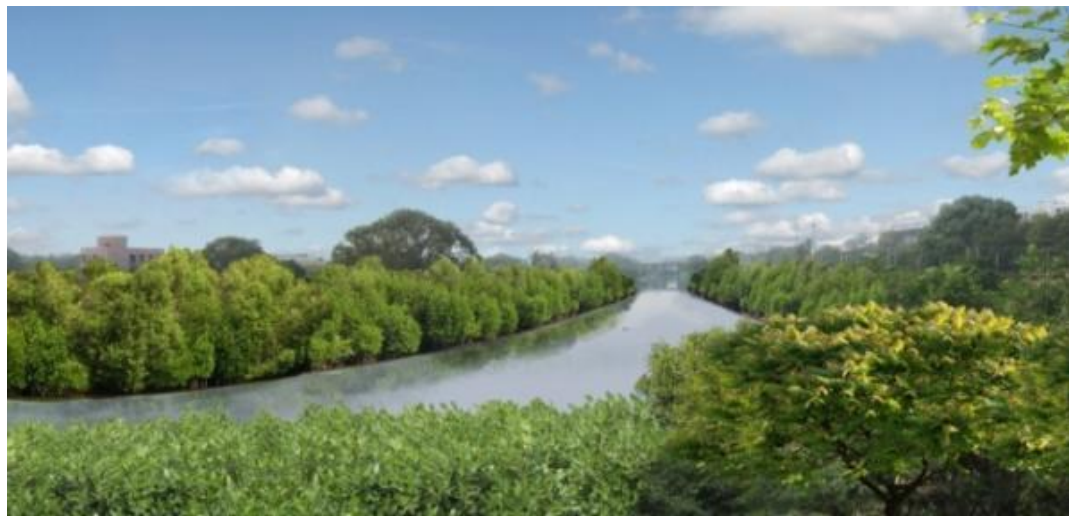
Figure 11. Riverfront regeneration through Mangroves development on Island Grounds

Proposals are completed with almost fifty areas of river bank vegetation improvement. Parks, walkways, maintenance ways and cycle tracks to be developed. River banks where river vegetation is improved and conserved will be fenced in order to avoid new encroachment and solid waste dumping.