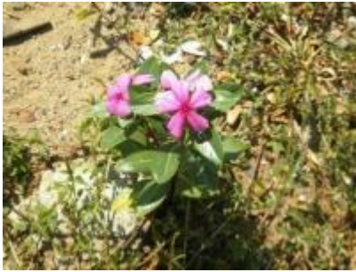
Figure 2. Catharanthus roseus L