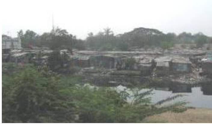
Picture 3. Quith E Millet Bridge to Old Jail slum on Island Grounds