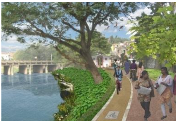
Figure 8. Riverfront improvement proposal in Bharathipuram area near Anna Nagar bridge

Taking into consideration the existing social policies and the environmental and social framework, the social assessment provides a balance between the proposed solutions and the potential social impacts. This phase analyses several alternatives for minimizing the social impacts, identifies the potential impacts such as PAFs 34 , affected lands, existing current regulations and finally presents the Resettlement Action Plan options taking into account policy provisions and entitlements available in the National R&R 35 Policy 2007/ RTFCTLARR Act 2013 36 entitlement matrix.