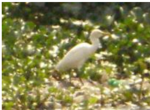
Figure 6. Image of a Egret