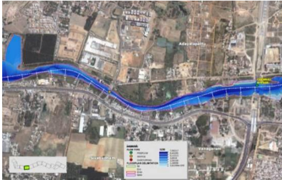
Figure 1. Floodplain delimitation for 2, 10, 100 and 200 year return periods.