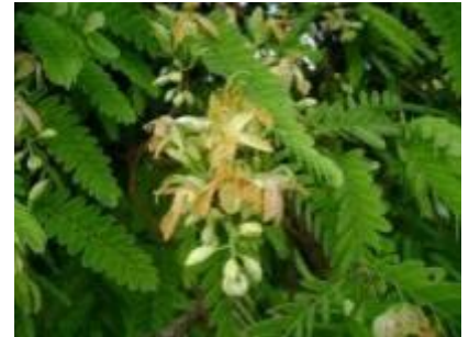
Figure 4. Tamarindus Indica