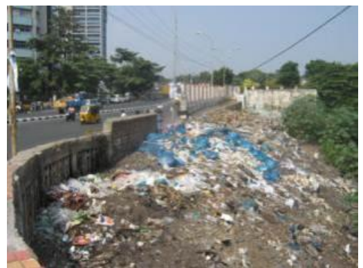
Picture 2. Solid Waste Dumping along Cooum River near Periyar Bridge

Presently, Solid Waste dumping along the Cooum River is done indiscriminately. This procedure however, poses serious concerns, since it is an extended habit throughout the population living along the Cooum River. As such, this situation is a high source of pollution, encroachment and source of diseases due to the increased presence of disease carrying vectors.