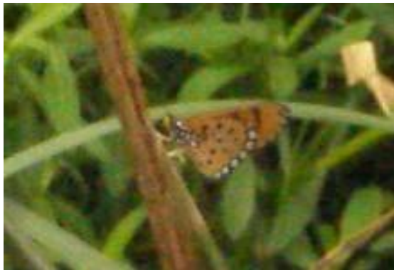
Figure 5. Image of a Plain Tiger