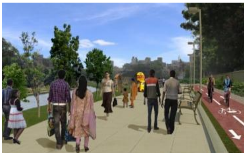
Figure 9. Park development proposal near Choolaimedu bridge

Encroachments on the Right of Way line and Coast Regulation Zone have also been analysed together with the data provided by CMDA, PWD 40 and TNSCB 41 . After a number of site visits and a multi criteria analysis, four different categories have been set on the river banks, trying to identify similarities along the 32 km of the river. These categories depend on the action to be developed and they are river front development, river front improvement, urban renewal & urban regeneration.