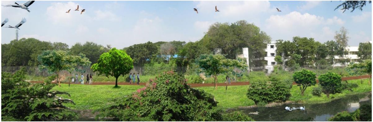
Figure 10. Walkway development proposal near Munroe bridge

The river front system is completed with a 19 km long cycle track that will provide a new infrastructure for non-motorised mobility along the Cooum river banks.